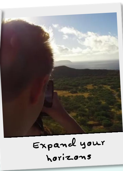
Expand your horizons