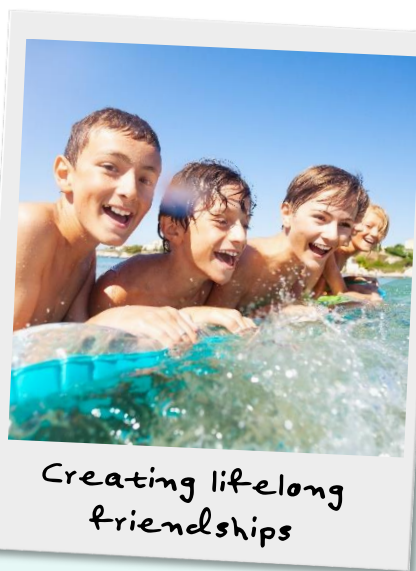
Creating lifelong friendships