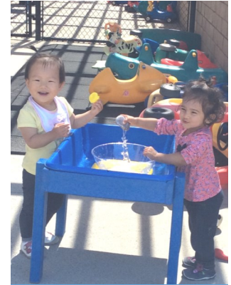
The Perfect Balance of Learning and Play

Your child may experience anxiety, tears, not liking school or their new teacher, all of this is normal during transition to a new classroom. Although, they may have so much fun that they will stay in the new classroom since day one. Please give the teacher a month to bond with your child; remember they will begin to establish new friendships and relationships in the new classroom